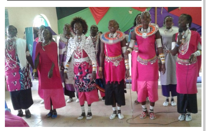
The women's choir in Ingurumani Mission singing during Women's World Day of Prayer.

We give thanks for this annual worship service where we can highlight the important contributions of women in the church here in Kenya and all around the world.