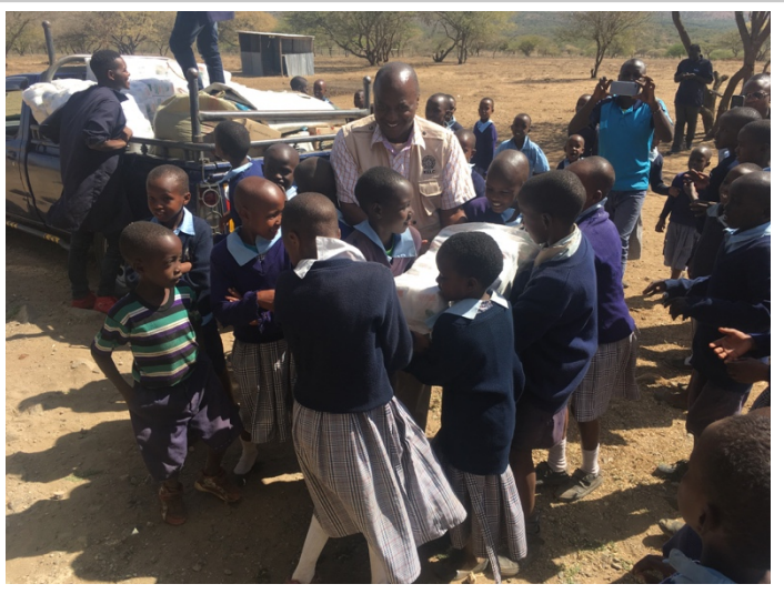
Food relief distribution at Oliorum Lutheran Primary School in Kajiado County.